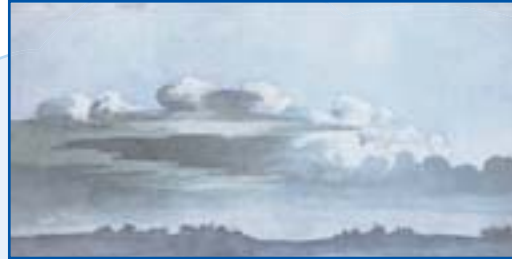
Cloud study by Luke Howard, painted sometime between 1808 and 1811

Luke was still very interested in clouds. Since there were no scientific names for different types of clouds, it was hard to write about them. He painted pictures of clouds instead. These are some of his paintings.