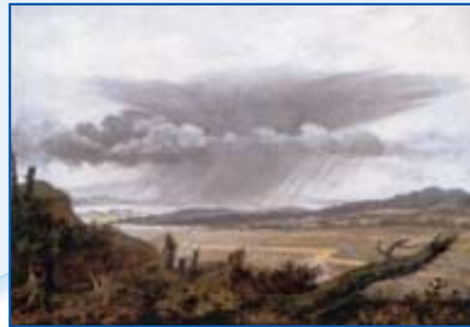
Landscape and cloud study by Luke Howard, painted sometime between 1808 and 1811

Luke's father thought cloud-watching was a waste of time. He wanted his son to learn a trade so he could get a good job. After a few weeks at home, Luke was sent away to work as an apprentice in a Quaker chemist shop, where medicines were made and sold.