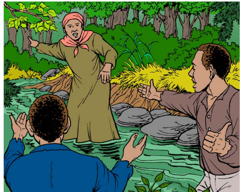
If Harriet had continued, her brothers may have been tortured into revealing where she was going.

One day, Harriet's owner died. Harriet knew the slaves would be sold; it was time to go. Harriet and two of her brothers ran away, but soon after they left, the brothers gave up, forcing Harriet to return with them.