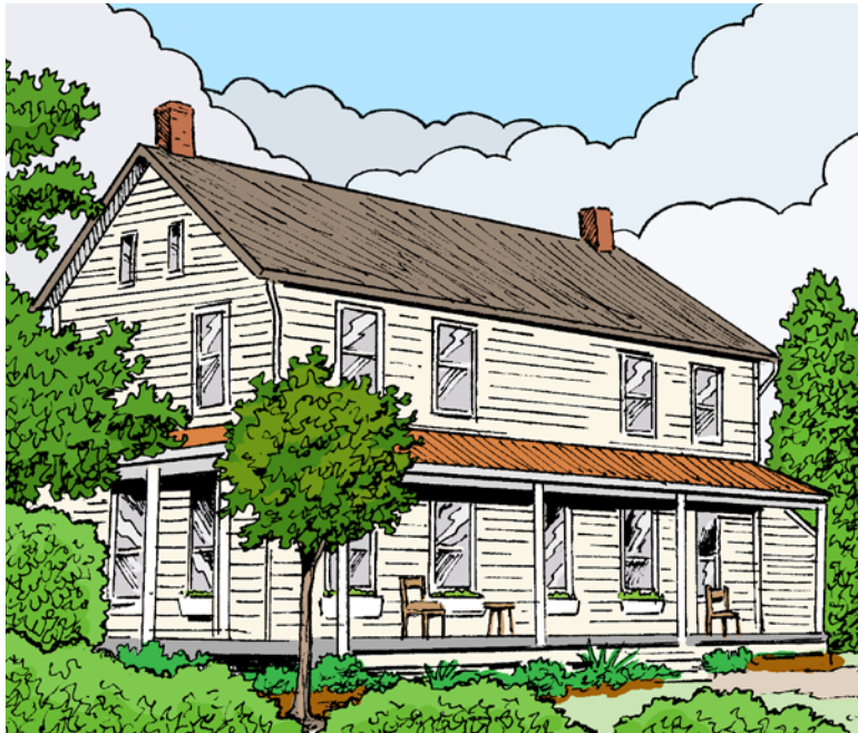
The Harriet Tubman Home housed elderly freed slaves.

Harriet Tubman died March 10, 1913. She devoted her long life to freedom. She will always be remembered as a true hero.