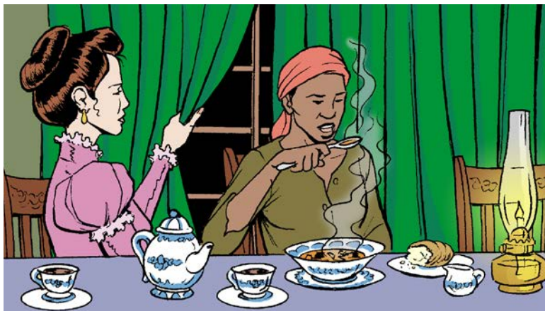
Abolitionists' help allowed Harriet to escape north.

Two nights later, Harriet escaped alone. She went to the home of an abolitionist woman who had offered help. The woman fed Harriet and let her sleep, and then she directed Harriet to the next safe place. When Harriet reached that house, the people there directed Harriet to her next stop. This secret network of safe homes was called the Underground Railroad .