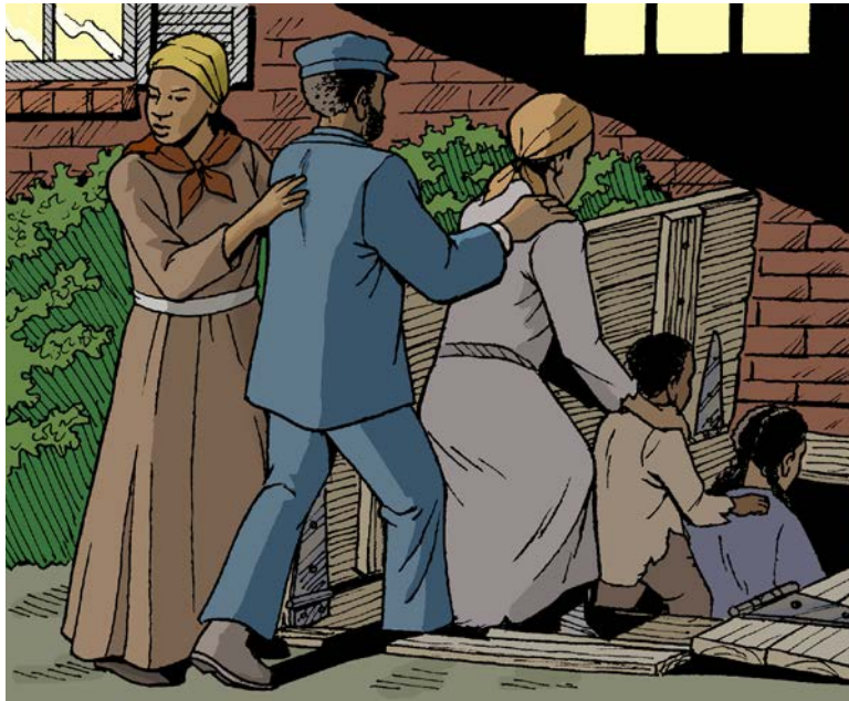
Harriet guided escaping slaves to safe houses.

Harriet made nineteen perilous trips back to the South, ignoring her own danger in order to become a conductor of the Underground Railroad. She guided escaping slaves from one safe resting place to another. A “station” on the Underground Railroad was usually an abolitionist’s home, or sometimes it was a church or another safe resting place. Some of the “stations” had secret rooms to hide the escaping slaves. Sometimes the slaves rode from place to place hidden under false bottoms in conductor’s carts.