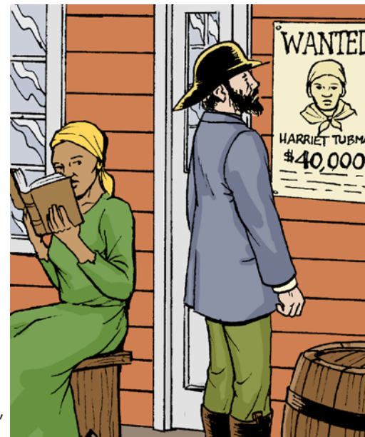
Even with the reward, no one turned Harriet in.

Slave owners were furious, and they offered a reward for Harriet’s capture, dead or alive. The reward was $40,000—an enormous amount of money for those days. One day, Harriet overheard a man reading her own wanted poster, which described Harriet as not being able to read. She immediately pulled out a book and pretended to read it, and the man left without giving her a second look.