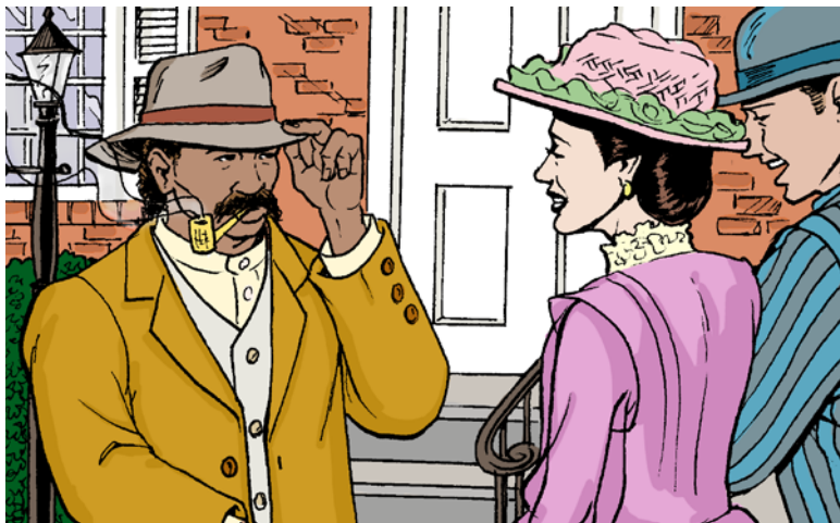
Harriet often disguised herself as a man.