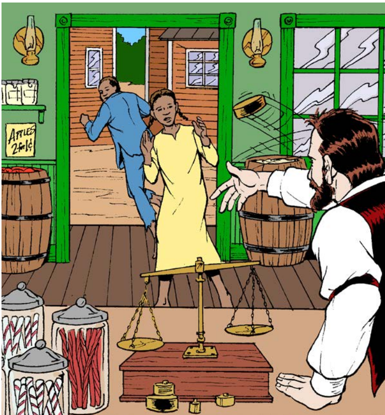
The weight left Harriet with a large scar on her head.

When she was a young girl, Harriet tried to help an escaping slave. The slave's master threw a metal weight at her, and it struck her in the head. Harriet almost died from the wound on her forehead. For the rest of her life, she had headaches and sleeping spells because of her injury.