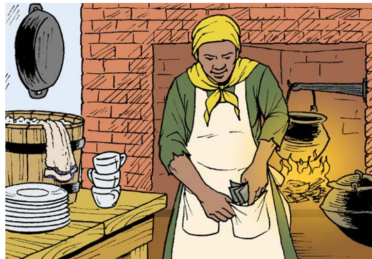
Even in the north, African-Americans were paid little.

To escape, Harriet walked 100 miles (160 km), alone, through unknown land. She traveled at night and hid during the day. Finally, she arrived at the border of Pennsylvania, a state where slavery was illegal. Harriet was free!