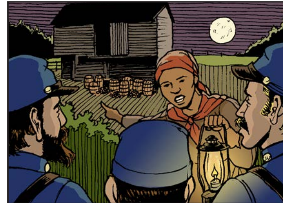
Harriet led Union soldiers to arms and ammunition stores.

On April 12, 1861, the Civil War began. The North and South fought each other over the right to own slaves. During the war, Harriet worked as a nurse for the North’s Union Army. She was also a spy, scouting out the Southern army’s weapon warehouses, and she continued to travel into the South to lead slaves north.