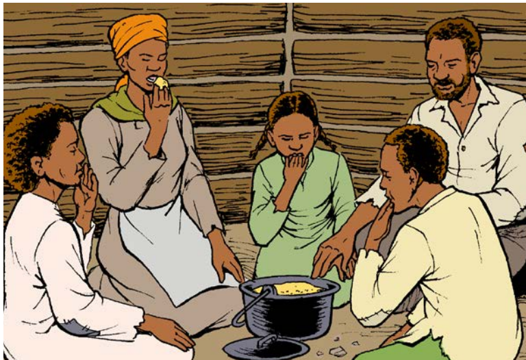
Harriet's entire family was forced to work without pay.

Harriet's great-grandmother was the human property of a man she called her master. All of her children and grandchildren were slaves, too. The slaves were forced to do hard labor and were punished cruelly at times. They received no pay, only meager food and housing that was no better than that of farm animals. Many of them were never taught to read and write. Slaves had no freedom to go where they wanted, and sometimes they were not allowed to marry or raise their own children. Members of slave families could also be sold to different masters, breaking up the family.