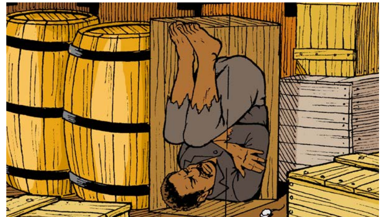
Henry "Box" Brown

Slaves went to great lengths to escape to freedom. Some shipped themselves north in boxes. One man, Henry "Box" Brown, nearly died during his escape when the box he was in was turned upside down for hours. Henry made it to Philadelphia, and freedom, after twenty-six hours in his box.