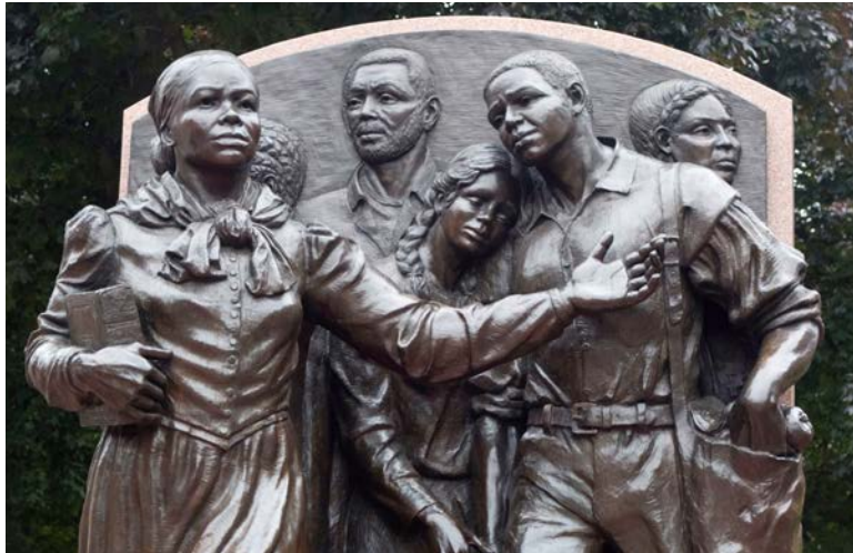
This is one of many memorials honoring Harriet Tubman.

Harriet helped many of her own relatives out of the South. Thanks to Harriet, six of her ten brothers and sisters escaped. On one difficult journey, she brought her elderly parents north to Canada.