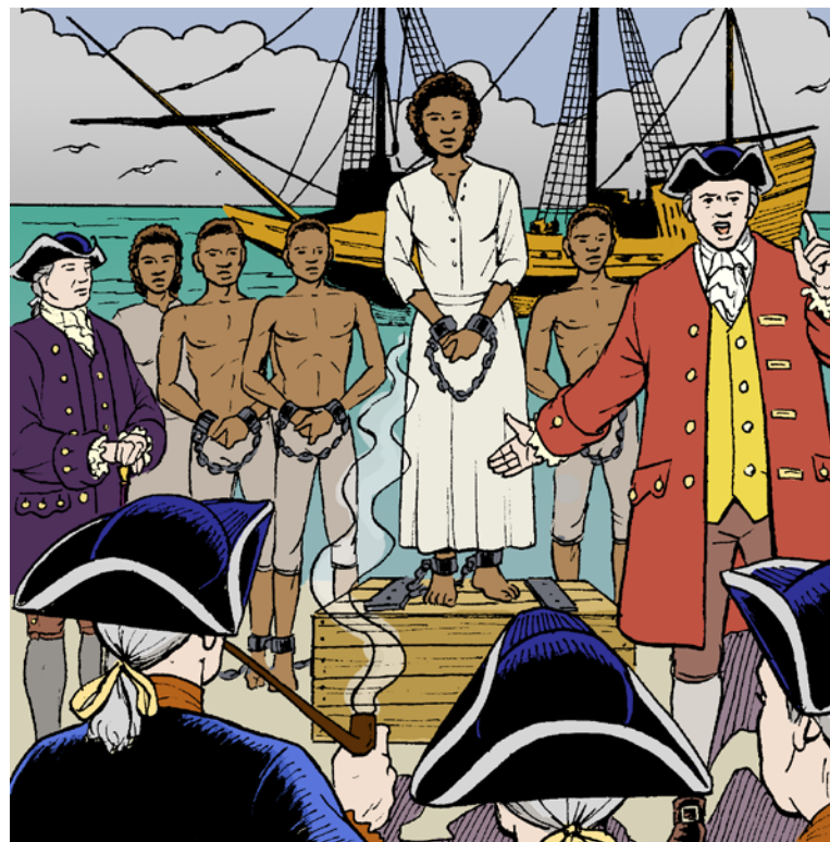
Slaves were sold at humiliating auctions.