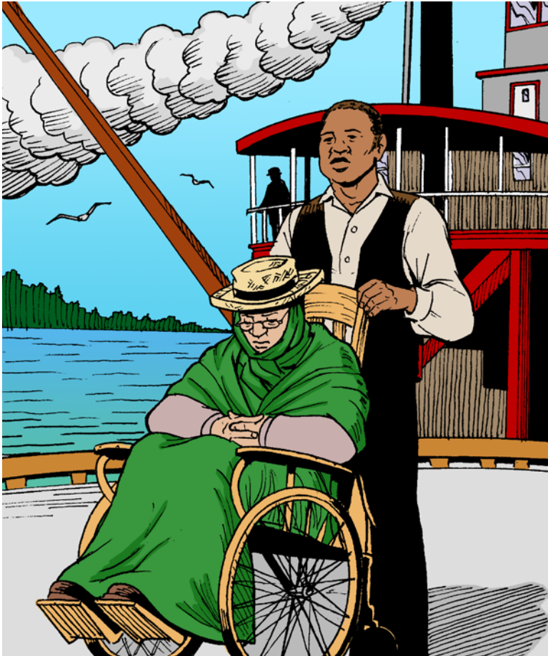
The Crafts were one of many families that used clever disguises to escape.

One light-skinned slave woman, Ellen Craft, disguised herself as a white man accompanied by a slave. The slave was actually her husband, William Craft. The Crafts traveled by train and steamship, and reached Philadelphia on December 25, 1848.